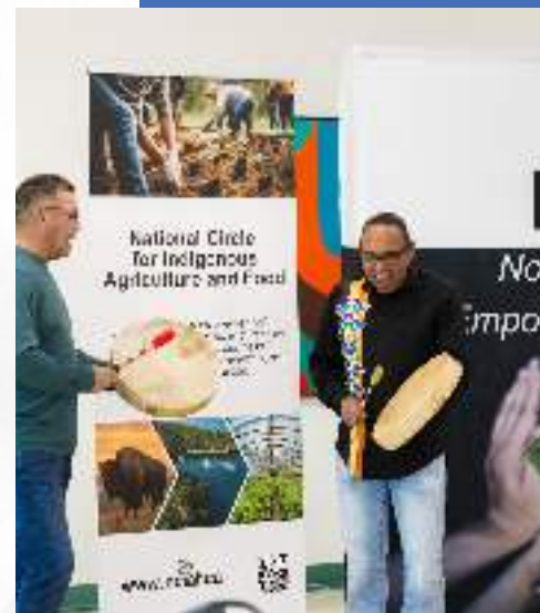
Lone Creek Drum Group: Performing the Honor Song